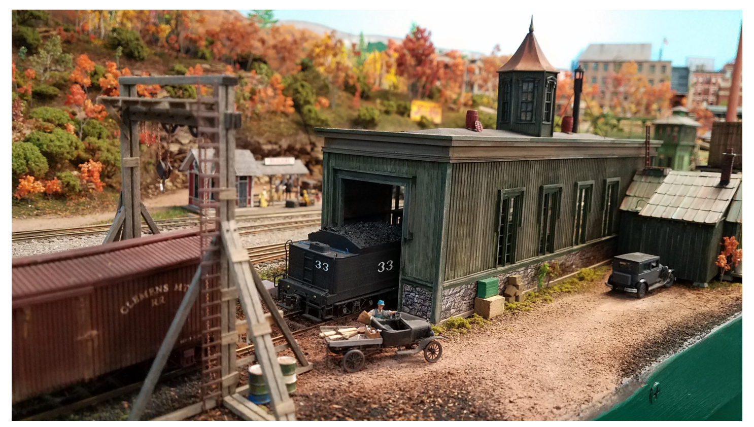
▲ Number 33's tender peaks out of the St.Claire engine house. The structure was a gift from Ed Black MMR. With a few small changes such as an additional door and a fresh coat of paint, it has found a home on Greg's railroad.

▼ LS & MS boxcar #D19077 has just been spotted at Hendrix Type Foundry, while MC&CS box is not quite ready to be released. The foundry is a modified kit offered by Foscale Models and both of the Central Valley cars boxcars were picked up 2nd hand by Greg and re-detailed.