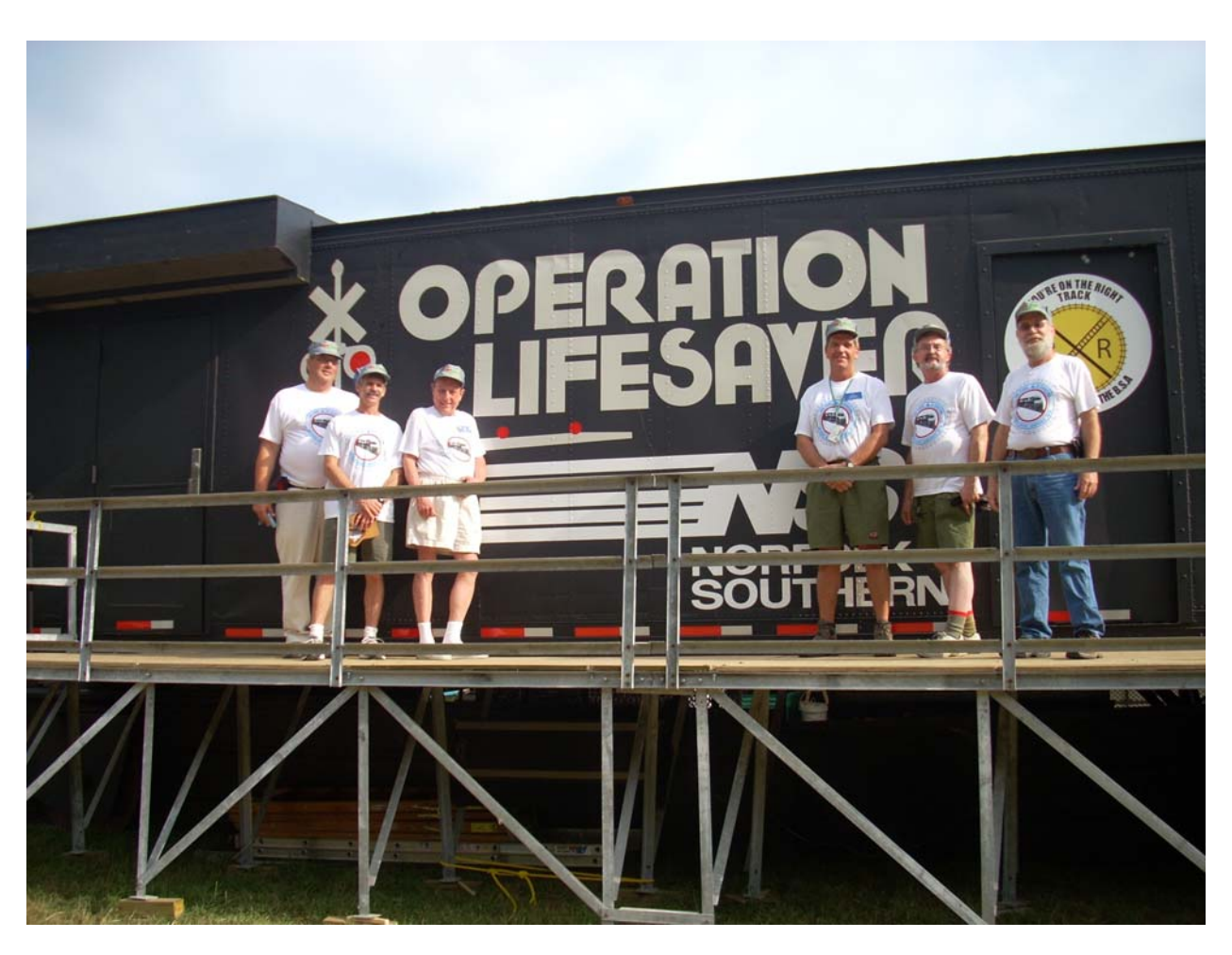
Boy Scout Railroading Merit Badge- 8

The good news is that, since the early 1990's when the BSA was going to retire the RRMB, the numbers have steadily increased. In 2008, over 6,000 scouts earned the merit badge. This puts the RRMB about in the middle of the list of available Merit Badges, and well out of range of those merit badges that the BSA is looking at retiring.