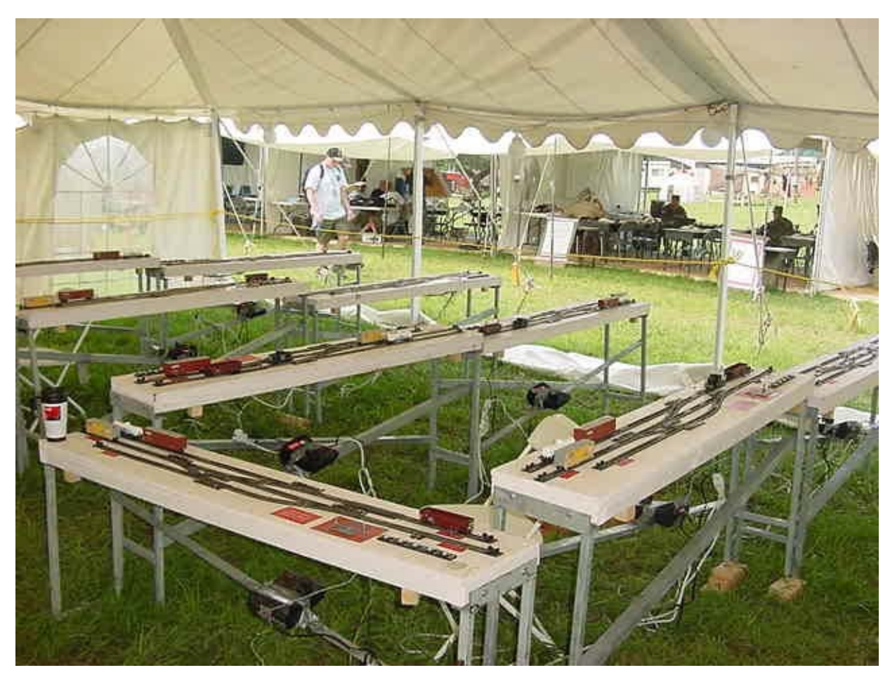
Boy Scout Railroading Merit Badge- 19