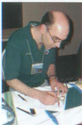
4dPNR monthly clinics show you how to achieve your model railroading goals!

Most model railroaders start with train sets. Some embrace their inner child and enjoy spending hours running it in circles. Others strive to recreate reality in miniature. Whether you want to "play trains" or "build the world" or, as most, are somewhere in-between, you'll have questions.