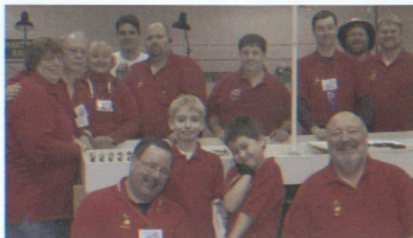
4dPNR sponsors modular groups for those without the time or space to build a home layout.

Join the NMRA and you'll discover a whole new world of modeling possibilities. We currently offer a six-month trial membership for less than ten dollars. For more information, including the location of the monthly clinics near you, visit www.4dpmr.org .